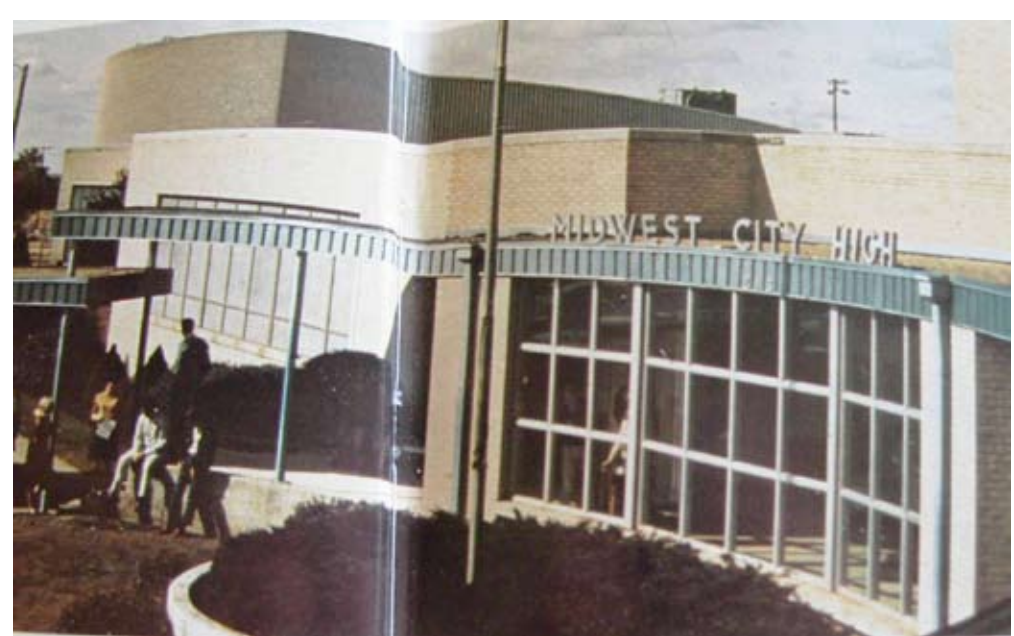
Midwest City High School front entrance at 213 Elm St. in 1968. This area is now the Midwest City High School Museum. The high school was remodeled in the early 1980s and began fronting Maple Dr.

In their book chapter on Impact Aid in Conservatism and American Political Development (2009),